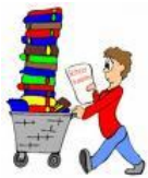
KidzShop August 15th

KidzShop is just around the corner, August 15th is the date to remember.