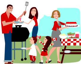
Past President's Picnic July 29th

This year it was decided to combine the 5th Wednesday and President's Picnic.